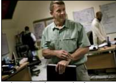
Prince in the tactical-operations center at a company base in Kabul.